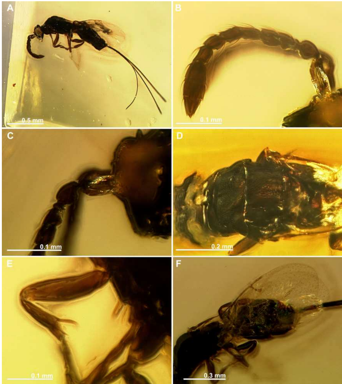
Figure 1: Idarnes thanatos sp. nov. Female. A habitus in lateral view B antenna C detail of antenna D mesosoma in dorsal view E detail of profemur and protibia F wings.