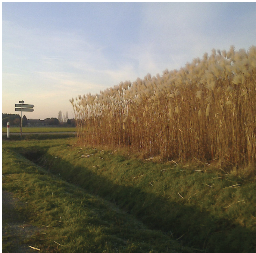
Figure 1: A Miscanthus field in Burgundy.

In the adaptation step, we use the rules of the farmer associated to the source case to build the solution. Adaptation knowledge allows the appropriate rule to be chosen and applied, according to a given adaptation context: the system