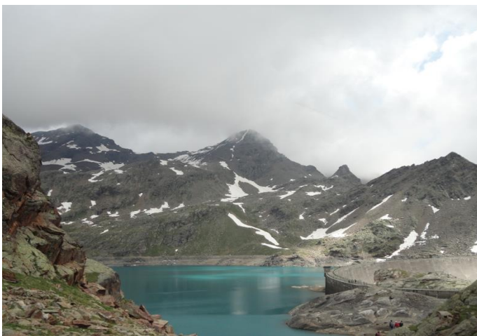
The Pian Palù Lake in Peio, Italy – glacier and micro-hydropower

At large time scales (years and more), climatic drivers of wind and solar power show much less intra-annual to multi-decadal variability than drivers of hydropower. Expected climate changes are likely to modify CRE potential, especially for hydropower. Confidence in the projected modifications depends on the ability of General circulation models (GCMs) to simulate the climate of the last decades.