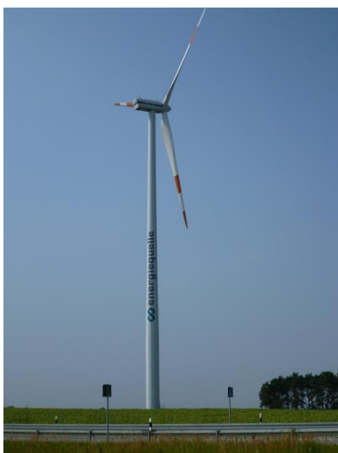
Wind turbine

In addition to estimating the abundance of CRE, measuring the easiness of integration is a critical step for the design of a mixed CRE system that directly depends on local climate variability. Dependencies on the scales must be considered: hourly and daily optimal mixes can be quite different and differences can also be seen from one place to another.