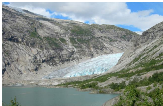
The Nigardsbreen Glacier in Norway