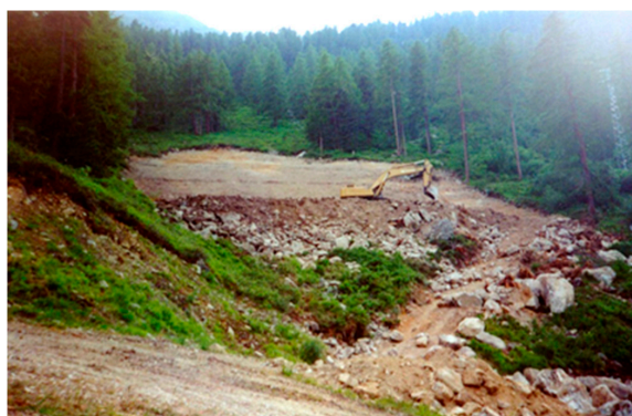
Figure 1. Ski-run construction below the treeline in the Italian Alps.

In Europe, the treeline oscillates around 2000 m above sea level. Surface corrections below that limit mainly affect forest soils (Figure 1), while at higher elevations geomorphological features such as rock glaciers or patterned ground areas are disturbed, although the disturbance of soil properties and alpine vegetation also have to be considered (Figure 2). Machine-grading is a common practice at all elevations in the Alps and, in comparison to clearing is more damaging to multiple indicators of ecosystem functions [16]. The impact on soil properties observed in graded ski runs may be especially long-lasting in high-elevation ecosystems where soil development tends to be slower. Nevertheless, if best practices for soil management are carried out, the ski-runs can be successfully used for grazing during the summer months.