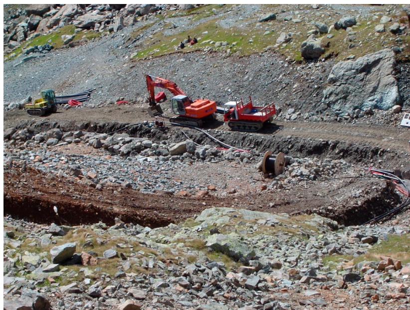
Figure 3. Construction of artificial snow-making system above the treeline in the Italian Alps.

The reduction in ski season length due to climate change could be mitigated if artificial snowmaking is employed [19]. However, the economic limits of snowmaking are still poorly understood and potential increases in energy price and/or shortage of fossil fuels could affect the profitability of snowmaking [19]. This encourages new areas of research to be developed in order to better understand the winter tourism system.