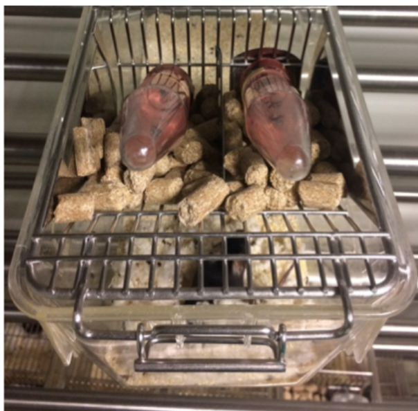
Figure 2. Position of the bottles. The position of the bottles is changed during the protocol (see Procedure) in order to habituate the mice to drink from both positions. However, bottles must be maintained at the same height and angle throughout the protocol. Note that food is distributed in both sides of the metal grid.