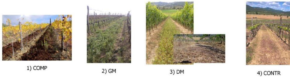
Figure 4. Pictures illustrating applied restoration strategies: COMP , composted organic amendment; GM , green manure; DM , dry mulching and the degraded control ( CONTR ).

The farms where cover crops had a good growth were: SD (Italy), CC and ET (Turkey). These farms had in common emergency or regular base irrigation and seedbed preparation by rotary tiller. In some cases, as FON (Italy), VS and VL (Slovenia), good cover of natural grass was observable instead of seeded cover crops.