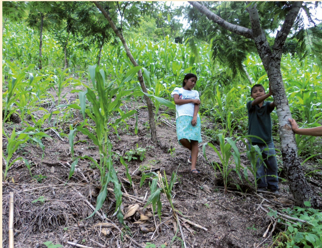
Photo 1. Children from the village of Canaparé Abajo in Jocotán, showing the trees in their corn crop.

Auteur correspondant / Corresponding author: Nicole SIBELET – sibelet@cirad.fr