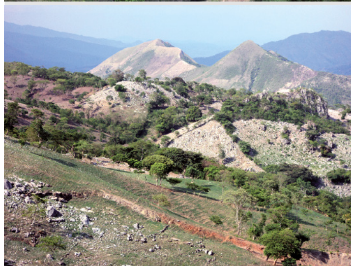
Photos 3. Landscape with conventional cropping system based on maize and bean crops in Camotán and Jocotán.