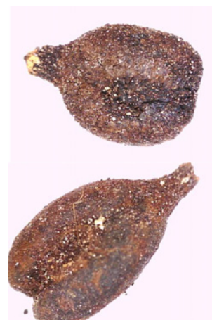
Figure 6. Newly discovered grapevine seeds from wine vessel Qvevri (Gldani site, medieval period).

The examination of samples from “Gadachrili Gora” and “Shulaveris Gora” demonstrates that grape pollen was widespread and abundant in many of the excavated early Neolithic contexts at both sites, but is absent from the modern top soils of the sites [2]. The nearest grapevines in the area today are several kilometers away, and any modern pollen would not be able to reach the sites by wind. As a