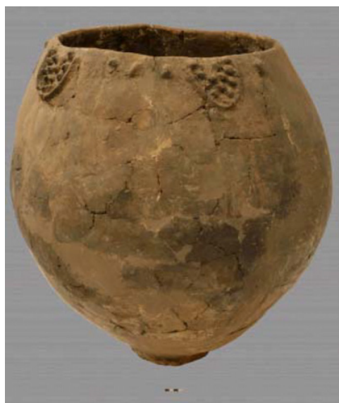
Figure 3. Representative early Neolithic jar from Khramis Didi-Gora (field no. XXI-60, building no. 63; depth, –5.45 to –6.25 m). (By McGovern et al. [2]).