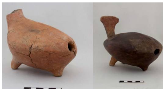
Figure 7. Two zoomorphic Rhytons from “Dedoplis Gora” archaeological site (Kura-Araxes Culture, Early Bronze Age).