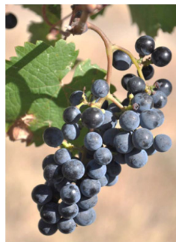
Figure 5. Wild grapevine ( Vitis vinifera ssp. silvestris ) “Ninotsminda 01” originated from Sagarejo district, Kakheti.

In 2017 an investigation of wild grapevine in the Jighaura collection originated from Kakheti, Kartli and Lechkhumi provinces of Georgia was started (Fig. 5). The research of 28 genotypes was organized by established methods of ampelography, phenology, eno-carpology, enology, eno-chemistry, ethnobotany and plant pathology in 2017 and 2018 based on the protocols suggested by COST ACTION FA1009 project [34–36]. Two