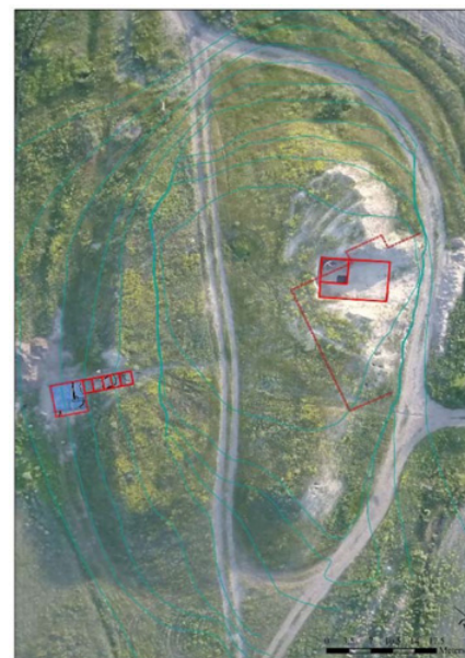
Figure 2. A plan for 2017 excavation of Shulaveris Gora.

at Shulaveris (Fig. 2). These efforts have been successful in providing a more expanded context with which to evaluate recovered samples of pottery (ceramic), lithic (stone tools), faunal (animal bone), paleobotanical (plants/seeds) and geological (soil) and shed light on the economy and way of life in this pivotal period of experimentation in agriculture and horticulture in human history. The results of the study and analysis of all these samples have begun to emerge [2,16,17] and have begun to change our understandings of the Neolithic of the Greater Near East.