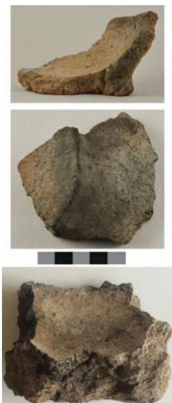
Figure 4. The fragments of the jars included in biomolecular analyses: (A) Jar base SG-16a, interior and cross-section. (B) Jar base SG-782, exterior. (C) Jar base GG-IV-50, interior (By McGovern et al. [2]).

The project enabled us to develop a new, sensitive approach to identifying all the main organic acids in wine, viz. tartaric, malic, citric, and succinic. Further extraction refinements in our Gas Chromatography – Mass Spectrometry (GC-MS), Fourier-transform Infrared Spectrometry (FT-IR) and Orbitrap Liquid Chromatography Tandem Mass Spectrometric (LC/MS/MS) analyses were also made.