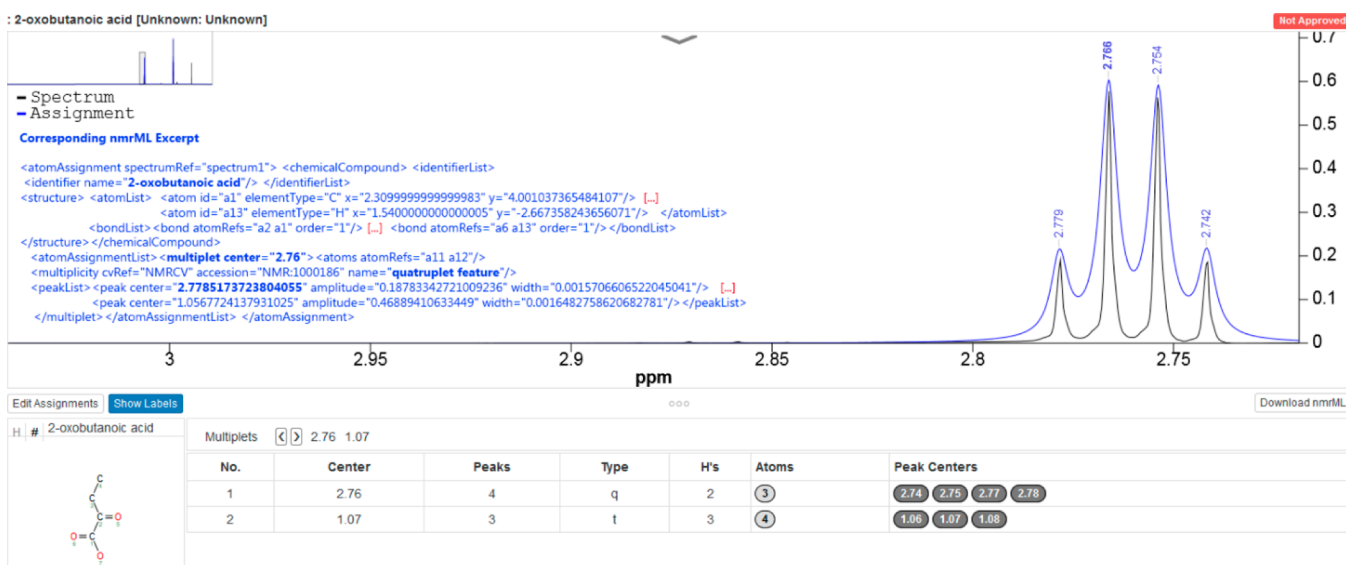
Figure 2. Assignment of an identified molecule in a single compound spectrum, generated in nmrML-Assign and displayed using the JSpectraViewer (JSV). An uploaded raw FID for the 2-oxobutanoic acid reference compound was automatically processed with Bayesil. The resulting interactive JSV spectrum then allows the assignment of peaks to specific atoms, using the nmrML-Assign tool. The assignment metadata is then saved in the nmrML format (see https://github.com/nmrML/nmrML/tree/master/examples/reference_spectra_examples/hmdb ). An excerpt view of the corresponding nmrML code (blue code inset) is shown for the quadruplet assignment (Multiplet no. 1) of the second peak (bold code). The corresponding HMDB entry is available from http://www.hmdb.ca/metabolites/HMDB00005 , with the 1 H spectrum found at http://www.hmdb.ca/spectra/nmr_one_d/1024 .

nmrML version, the sources of the controlled vocabularies or ontologies used for metadata annotation, the data depositor contact, source files/formats, software lists, the instrument configuration, sample information (e.g., solvent and reference standards), acquisition settings, and data processing information. This is followed by the spectral FID raw data, as a base64-encoded binary. In addition to such a “minimal” nmrML data file, additional information such as molecule identification/spectral assignment metadata and quantification data can also be included. For example, if the NMR data is for a pure reference compound or a newly isolated/synthesized single chemical, the nmrML file can include data on the chemical structure and corresponding atom-specific peak feature assignments (see example generated by nmrML-Assign in Figure 2 or http://nmrml.org/examples/3 ). If the NMR data is for a complex mixture, consisting of many different compounds from an analytical setting, the nmrML file can include data on peak positions, integrated peak areas, and putative peak assignments, together with relative or absolute concentrations of some or all of the compounds but no annotation of individual peak features to atom environments (see http://nmrml.org/examples/4 ). Code examples of a minimal nmrML data XML file as well as for the expanded metadata case are provided on the examples page ( http://nmrml.org/examples ).