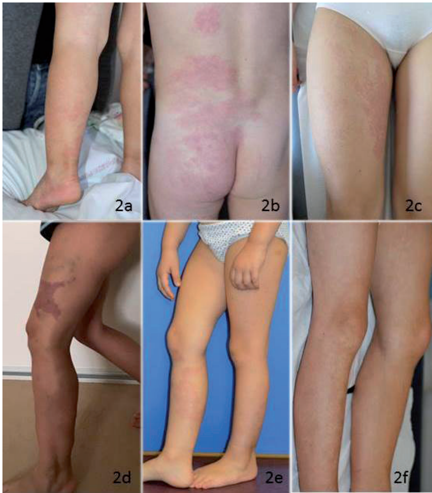
Fig. 2. Examples of clinical characteristics. (a) A 28-month-old boy with widespread capillary malformations (CM) of the left leg (variant p.A99V). (b) A 33-month-old boy, showing CM extending to the back (variant p.A99V). (c) A 9-year-old girl, with CM of her right thigh (variant p.A99V). (d) A 4-year-old girl, showing a geographic-type CM of her left thigh associated with dilated veins and macrocystic lymphatic malformation of her left buttock (variant p.L116V). (e) A 31-month-old girl with bilateral CMs on legs (intronic variant). (f) A 7-year-old boy showing widespread bilateral CMs (variant p.N451S).