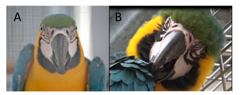
Fig 5. Examples of head displays. A) Photograph of a macaw with all feathers sleeked. B) The same macaw with all feathers ruffled.

In the second part of the study, we found significantly more seeking behaviours towards the caretaker during the control phase than during the mutual interaction phase. As predicted,