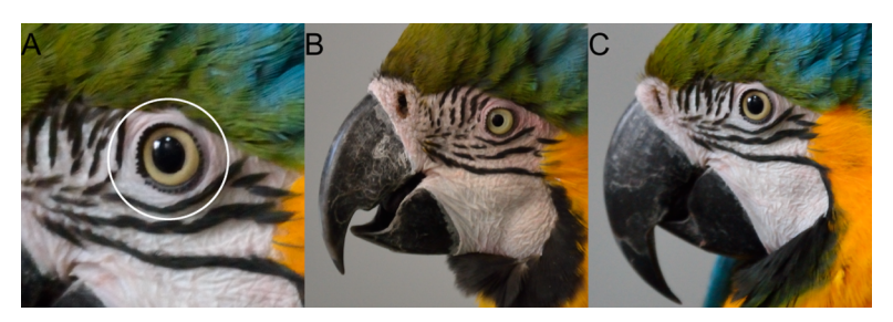
Fig 2. Examples of photographs. A) Target zone used to estimate the presence or absence of blushing by a panel of 4 naïve observers. B) Photograph where all observers judged blushing to be present in the target zone. C) Photograph where no observers judged blushing to be present in the target zone. (All photographs taken by A. Beraud).

We also took one close-up photograph of the bird's left profile at the end of each phase (20 photographs per bird) with a Nikon D3100. To assess the presence or absence of blushing on the bare white cheek skin, 100 images were taken with 20 images per bird (1 per phase x 10 sessions). Three images were discarded due to blurring (all with the caretaker's back to the bird). A panel of four naïve observers visually assessed the presence or absence of blushing on the ring of bare skin around the eye (Fig 2). This zone was chosen from preliminary observations when we observed that blushing was not diffused homogeneously throughout the entire bare skin patch surface. This area around the eye blushed the most frequently. The percentage of inter-observers accordance was 88.15%.