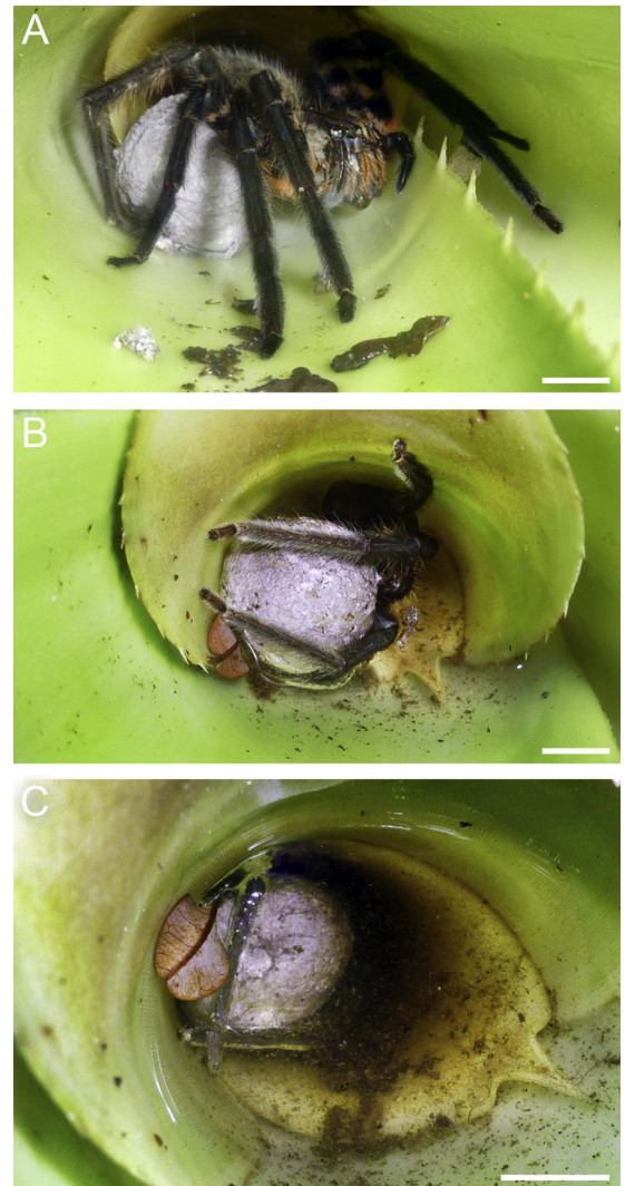
Fig. 2. Behavior of the spiders when carrying eggs. Moving the egg sacs, initially situated behind the spider, in front of the cephalothorax (A). Holding the egg sac, using the first legs (B), and diving into the water (C). The white scales represent 1 cm.

Although terrestrial (i.e. neither aquatic nor semi-aquatic), C. salei females have adapted to diving, but, because in this experiment they dove only when they carried egg sacs, this behavior is specifically related to their fitness (i.e. offspring protection). Indeed, wandering Ctenidae are highly susceptible to being preyed upon by birds in forest canopies and females are more attractive to