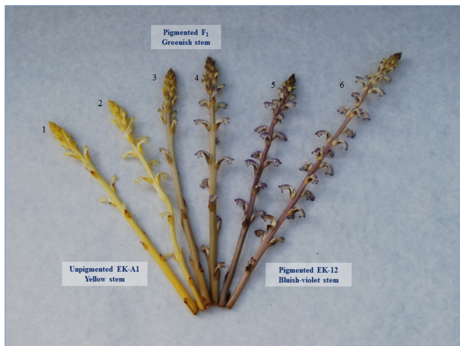
FIGURE 1 | Unpigmented O. cumana EK-A1 plants (1, 2), partially pigmented heterozygotes (3, 4), and fully pigmented EK-12 plants (5, 6) showing yellow, greenish, and bluish-violet stems, respectively.

Broomrape shoots were first collected from individual F_2 plants (single broomrape shoots), and individual plants from the parental lines EK-A1 and EK-12, and the other three O. cumana populations used for a polymorphism and diversity analysis (OC-94, EK-23, and SP). In order not to affect the F_3 seed production, the apical bud of each F_2 broomrape shoot was removed after most of the flowers had been formed. Because of the small amount of tissue collected in F_2 , tissue was also collected from F_{2:3} families (about 20 young F_3 shoots per family) in order to recreate their corresponding F_2 genotype. This is an accurate approach useful for species lacking enough tissue in individual F_2 plants to yield enough DNA for marker analysis (Kochert, 1994). In this case, 20 young F_3 shoots from each F_{2:3} family were collected before flowering, and bulked by mixing an equal tissue amount of the F_3 shoots from each F_{2:3} family. In all cases, tissue was immediately frozen at -80^\circ\text{C} , lyophilized, and ground in a laboratory ball mill. DNA was then extracted following the procedure reported by Pineda-Martos et al. (2013).