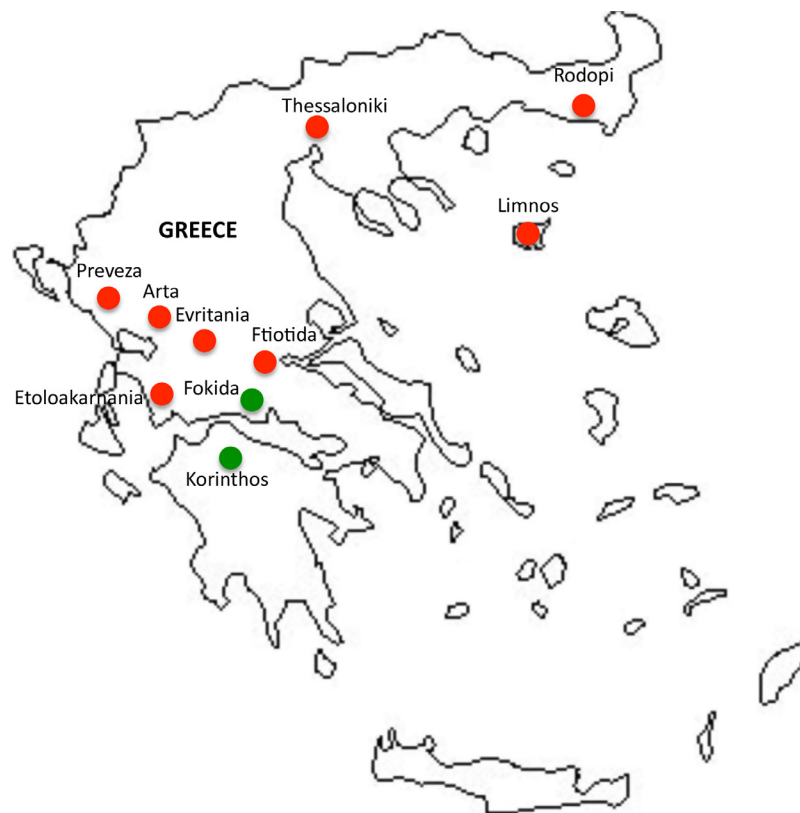
Fig. 1. Tick sampling. Map of Greece showing counties where ticks were collected from sheep and goats. The sites where CCHFV-positive ticks were collected are shown in green.

For proteomics analysis, internal tissues were dissected from the another half of CCHV-infected ( n = 2 ) and uninfected ( n = 4 ) ticks, lysed with phosphate buffered saline (PBS) supplemented with 1% Triton X-100 and complete protease inhibitor cocktail (Roche, Basel, Switzerland), and homogenized by passing through a needle (27G). Samples were sonicated for 1 min in an ultrasonic cooled bath, followed by vortexing for 10 sec. After three cycles of sonication-vortex, tick lysates were centrifuged at 200 \times g for 5 min to remove cell debris. The supernatants were collected and protein concentration was determined using the BCA Protein Assay (Life Technologies, Carlsbad, CA) with BSA as standard. Protein extracts (10 \mu g) from each CCHV-infected and uninfected ticks were on-gel concentrated by SDS-PAGE and trypsin digested as described previously (Villar et al., 2015). The desalted protein digest was resuspended in 0.1% formic acid and analyzed by RP-LC-MS/MS using an Easy-nLC II system coupled to an ion trap LTQ mass spectrometer (Thermo Scientific, Waltham, MA, USA). The peptides were concentrated (on-line) by reverse phase chromatography using a 0.1 \times 20 mm C18 RP precolumn (Thermo Scientific), and then separated using a 0.075 \times 100 mm C18 RP column (Thermo Scientific) operating at 0.3 ml/min. Peptides were eluted using a 60-min gradient from 5 to 40% solvent B (solvent A: 0.1%