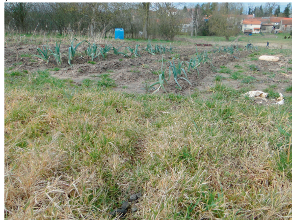
Figure 1. Two kitchen gardens in open access to carnivores and located inside (A) and outside (B) the village (at the forefront: a cat stool dropped close to the garden border).

gloves and put into separate labelled plastic bags. All collected faeces were decontaminated for 5 days at -80 °C and then stored at -20 °C before analysis.