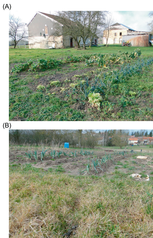
Figure 1. Two kitchen gardens in open access to carnivores and located inside (A) and outside (B) the village (at the forefront: a cat stool dropped close to the garden border).

Fox, dog, cat or unidentified faeces were first discriminated visually in the field on the basis of shape and size, and then more accurately categorised by identifying the host species through faecal real-time PCR [26] (described below). The field researcher's accuracy in discriminating cat, dog and fox faeces was verified by comparing the identification from morphological criteria to the identification of host species from molecular analysis. Faeces were collected with disposable