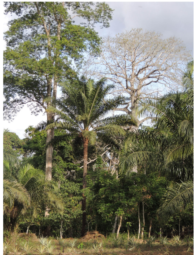
Fig. 1 Typical cocoa agroforestry in Central Cameroon. One can distinguish the three main strata that make up the agroforestry system: the cocoa stratum dominated by an intermediate stratum composed mainly of fruit trees, all dominated by a high stratum of forest trees

This method, proposed by Doré et al. 1997; 2008), allows understanding, for a crop, the yield variations, highlighting