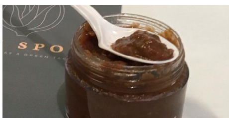
Figure A1. Fruit Compote Visual Appearance. Note: (1) visual appearance did not change between the fruit compotes (Aloe vera gel vs. pectin); (2) no specific labels were used and the jars were the same for the two products.