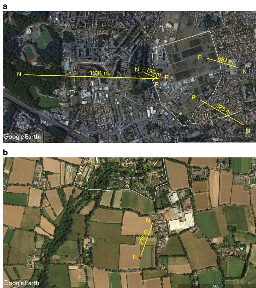
Fig. 3 Tracked hornets' nest locations. Captured hornet workers were fitted with a PicoPip Ag337 radio tag, released (R) in the vicinity of where they had been caught, and tracked via radio-telemetry on their return flights to their nests (N). Yellow lines and distances indicated relate to the shortest distance between a release point of a tracked hornet and her corresponding nest, rather than flight paths taken. a From the grounds of INRA Bordeaux-Aquitaine (white polygon) in Villenave d'Ornon, a suburb of Bordeaux. b Near Trinity and Durrell Wildlife Park (Les Augrès Manor; white polygon) on Jersey. GPS coordinates of the hornet release and nest locations were transferred onto satellite maps from GoogleEarthPro. Data on radio-tracked locations and waypoints are given in Supplementary Tables 2 and 3