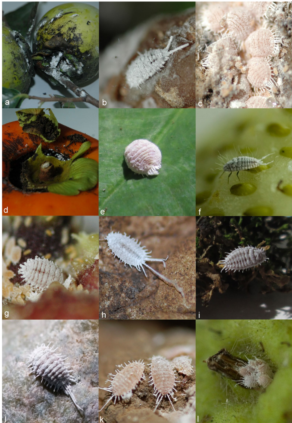
Figure 1. Mealybug species found in fruits on Serra Gaúcha region. (a,b) ♀ Anisococcus granarae (2.08–3.28 mm 55 ); (c,d) ♀ Dysmicoccus brevipes (1.3–2.7 mm); (e) ♀ Dysmicoccus sylvarum (up to 4.4 mm 25 ); (f) ♀ Ferrisia meridionalis (3.2–3.5 mm); (g) ♀ Planococcus ficus (1.4–3.2 mm 40 ); (h) ♀ Pseudococcus longispinus (1.0–4.0 mm); (i,j) ♀ Pseudococcus sociabilis (1.9–3.2 mm 43 ); (k,l) ♀ Pseudococcus viburni (1.8–3.5 mm 43 ).

the 28S and COI genes 18,23 . In the Serra Gaúcha region, Ps. viburni was observed at a low infestation level in apple orchards. Nymphs and adults were found often in the calyx and sometimes also near the pedicel of the fruit. When these mealybugs were present, damage was caused by honeydew excretion resulting in the development of sooty molds. In other countries, including Argentina, Italy, New Zealand and South Africa, Ps. viburni is considered the most economically important species found infesting apple and pears 30–33 . This species was also the dominant species in strawberry fields (>than 99% of the specimens collected). To date, there have been only three