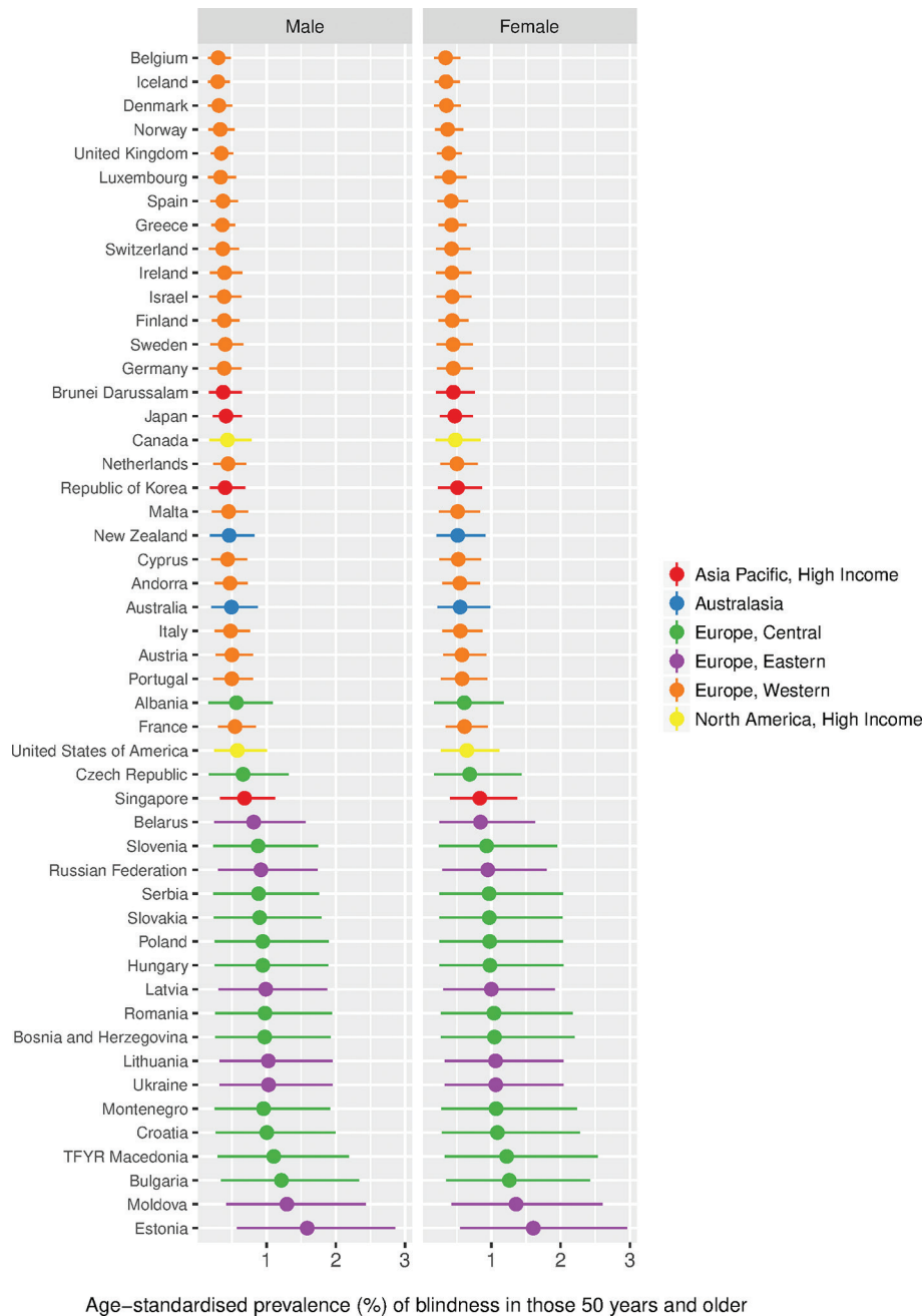
Figure 1 Ladder plot showing the age-standardised prevalence of blindness in men and women aged 50+ years for 2015. These are modelled estimates using prevalence figures applied to the individual populations of countries (point estimates with 80% uncertainty intervals are displayed).

Division's forecasts to derive the anticipated crude numbers and age-standardised prevalence estimates. 14 Finally, for estimating the causal attribution to the blindness and vision impairment burden, we estimated the proportions of overall vision impairment attributable to cataract, glaucoma, age-related macular degeneration (AMD), diabetic retinopathy, corneal opacity, trachoma, uncorrected refractive error and non-cause specific in 1990–2015 by geographical region and year. 3–5