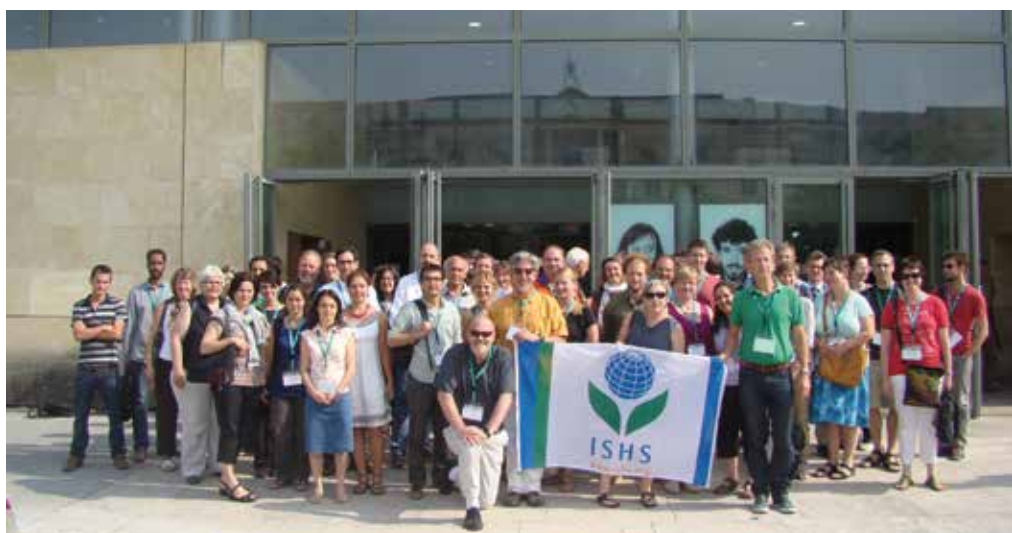
> Symposium participants in front of the venue, University of Avignon (new building).

Innovation was indeed a guiding keyword of the symposium, but its title also reflects the ambition to create bridges between integrated and organic (IN&O, like B&B), both aiming to limit our dependence on external inputs, to promote high standards of produce quality, to support farm financial viability, and to maximize ecosystem services.