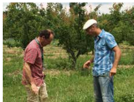
› Views from field trips in experimental stations and farmers' orchards.

Knowledge domains ranged from genes to the fresh product, and are considered to be an asset in mastering fruit production. Contributions mostly addressed the characterization of genetic variability based on the expression of genes or phenotypical traits. This background is important to master processes, especially when research work is done in situations of integrated or organic production. Specific questions addressed to/by plant breeders and physiologists in such situations should be clarified, beyond resistance to pathogens. The role of modelling as an integrated and predictive tool should also be clarified.