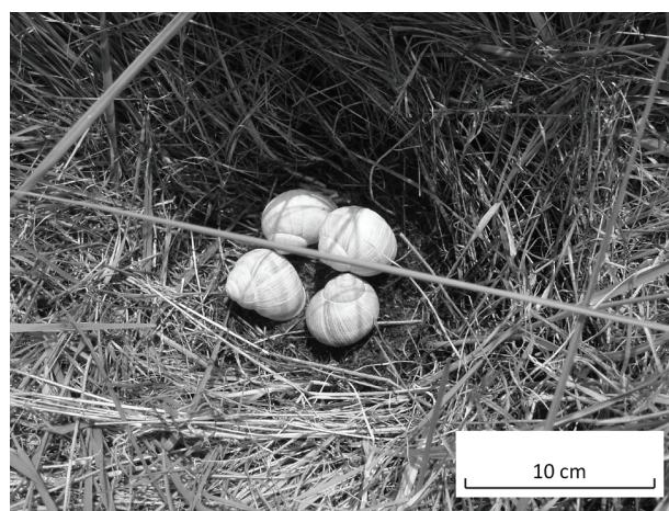
Figure 1. Picture of an artificial nest.

Artificial nests (Fig. 1) were designed to mimic real nests. They consisted in small (≈10 cm) radius cavities hosting four snail shells of Helix pomatia standing for the average number of eggs in a clutch (Ottvall 2004). Empty snail shells were preferred to eggs as in Paine et al. (1996) or Bareiss et al. (1986) to avoid predation by foxes or crows, for example, and focus on the effect of trampling. The need to conduct a daily survey of nests prevented us from using buried clay discs as in Mandena et al. (2013) as these could not have been checked every day. Empty snail shells were also preferred to clay discs laid directly on the ground as in Koerth et al. (1983) and Jensen et al. (1990) or to jam-jar caps as in Pavel (2004) to avoid stimulating the curiosity of the animals by introducing artificial elements to their environment. The use of snail-shells, however, could have induced snail-specific predation. To account for this risk in the study, we recorded disappeared and predated shells (26 in total) and replaced them by new ones the day we recorded it. Explicitly representing the eggs in the nest made it possible to limit the dependency of nest trampling to its size