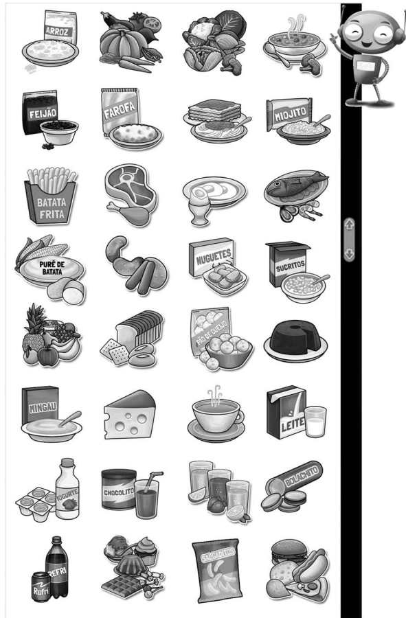
Fig. 1 WebCAAFE food choices presented on computer screen

After responding on the six eating events, children are requested to answer four questions about school meals.