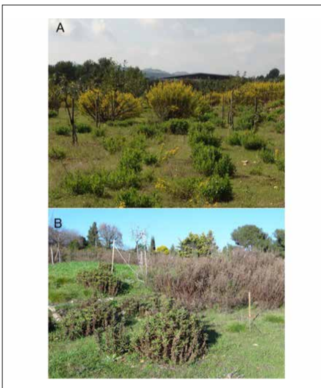
Fig. 2. Dittrichia viscosa in Southern France. A, October (autumn): plants which were not cut for several years (in flower at the background), and smaller plants which were cut in July (summer). B, January (winter): taller plants without green leaves (at right of the background), small plants full of green leaves.

Dittrichia viscosa is well known for its strong odor (Wang et al., 2004). The young stems and leaves are covered with glandular hairs which exude a sticky, strong-smelling oil. The leaves possess long protective hairs, numerous glandular hairs and stomatal complexes on both the abaxial and adaxial surfaces (Nikolakaki & Christodoulakis, 2004). Glandular hair