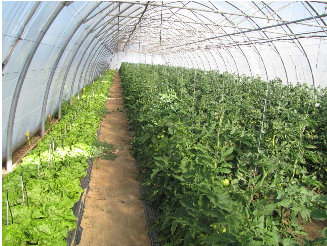
Figure 1: Experimental set up combining a lettuce crop (on each side of a greenhouse) grown together with a tomato crop (in the middle).