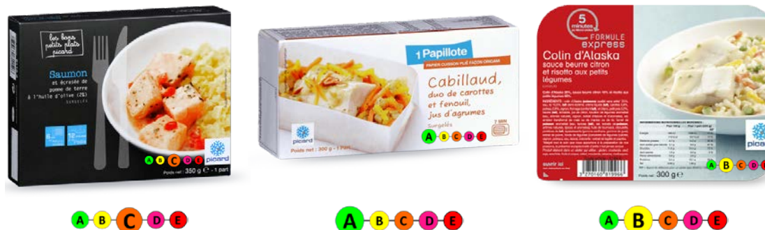
Figure 1. Screenshot of the stimulus material used in the study.

Objective understanding of the different FOP labeling formats was assessed in July 2014 via a Web-based questionnaire, under five different conditions: four alternatives corresponding to the four different FOP label formats and one alternative with no label. Subjects were asked to rank three products belonging to the same food category (e.g., Figure 1) according to their nutritional quality. Specifically, participants were shown pictures of the three products, each featuring the respective FOP label, and were asked: “From your point of view, please rank these products according to their nutritional quality”. For the ranking, participants could choose among the following options: “lowest nutritional quality”, “intermediate nutritional quality”, “highest nutritional quality”, or “I don’t know”. The three products were selected based on their differing nutritional quality, thus enabling ranking via the labels (except for the Tick format which enabled distinguishing only the top quality product). No other information on nutritional facts was provided and all quality labels (e.g., organic certification) were removed from the product images.