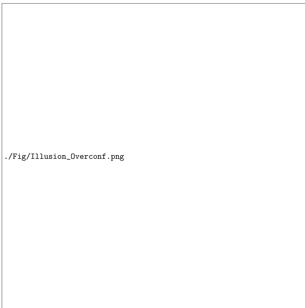
Figure 3: Kernel density estimate of overconfidence, by treatment. The vertical line indicates zero over- or underconfidence.