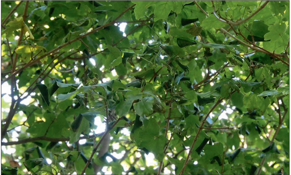
Fig. 2. Caloptilia semifascia larval spinnings on Acer campestre .

Records for those specimens are gathered within the project ‘Gracillariidae – PUBLIC records’ (code GRPUB) in the Published Projects section of the Barcode of Life Data systems (BOLD; www.barcodinglife.org ) (Ratnasingham & Hebert 2007). Information on specimen vouchers (field data and GPS coordinates) and sequences (nucleotide composition, trace files) are found in this project by following the ‘view all records’ link and clicking on the ‘specimen page’ or ‘sequence page’ links for each individual record. Sequences are also available on GenBank (Tab. 1).