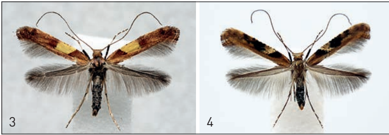
Figs 3 – 4. Caloptilia semifascia . 3. First brood form. 4. Second brood form.

types are reported; one occurs in Denmark (GRPAL118-10) and the Czech Republic (GRACI449-09) and is distinct by a single nucleotide substitution. The mean genetic variation within Caloptilia semifascia is 0.05, with a maximum distance of 0.15 between the nine individuals analysed. Interspecific distances are high in Caloptilia with up to 11.8 between C. semifascia from Denmark (GRPAL118-10) and C. stigmatella . The interspecific distances observed within the genus Caloptilia are on average 10.73 but can go up to 15.64 (Lopez Vaamonde unpublished data). These values are as high as those found in the genus Phyllonorycter (De Prins et al. 2009).