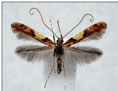
Fig. 1. Caloptilia falconipennella first brood f. oneratella .

i.e. initially mining and later producing the characteristic cones. The adults emerged in late June and July and Chrétien did not observe a second brood although he suspected there might be one. For an English translation of Chrétien's description see Fletcher (1940: 8). Subsequently, Leraut (1983: 36) synonymized G. pyrenaeella with G. hauderi , after designating lectotypes for both, and transferred the species to the genus Calybites . It is currently listed in the Global Taxonomic Database of Gracilariidae ( http://gc.bebif.be ) as Calybites hauderi (= pyrenaeella ) and its distribution is given as Austria,