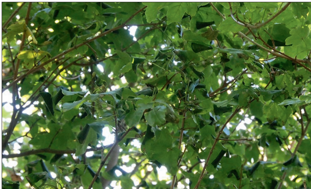
Fig. 2. Caloptilia semifascia larval spinnings on Acer campestre .

Records for those specimens are gathered within the project ‘Gracillariidae – PUBLIC records’ (code GRPUB) in the Published Projects section of the Barcode of Life Data systems (BOLD; www.barcodinglife.org ) (Ratnasingham & Hebert 2007). Information on specimen vouchers (field data and GPS coordinates) and sequences (nucleotide composition, trace files) are found in this project by following the ‘view all records’ link and clicking on the ‘specimen page’ or ‘sequence page’ links for each individual record. Sequences are also available on GenBank (Tab. 1).