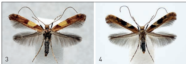
Figs 3 – 4. Caloptilia semifascia . 3. First brood form. 4. Second brood form.

types are reported; one occurs in Denmark (GRPAL118-10) and the Czech Republic (GRACI449-09) and is distinct by a single nucleotide substitution. The mean genetic variation within Caloptilia semifascia is 0.05, with a maximum distance of 0.15 between the nine individuals analysed. Interspecific distances are high in Caloptilia with up to 11.8 between C. semifascia from Denmark (GRPAL118-10) and C. stigmatella . The interspecific distances observed within the genus Caloptilia are on average 10.73 but can go up to 15.64 (Lopez Vaamonde unpublished data). These values are as high as those found in the genus Phyllonorycter (De Prins et al. 2009).