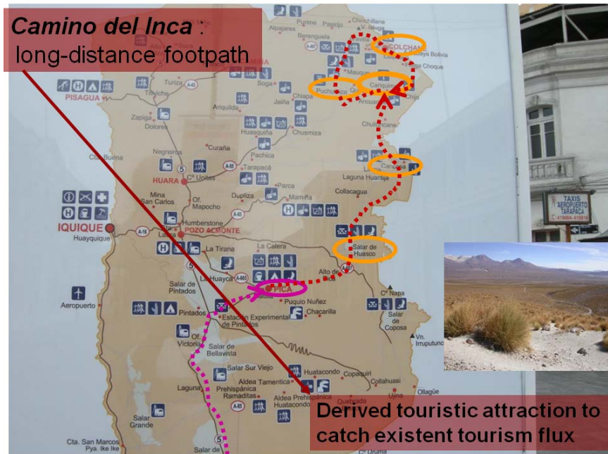
Figure 1: Tourism's experience in the Chilean highlands