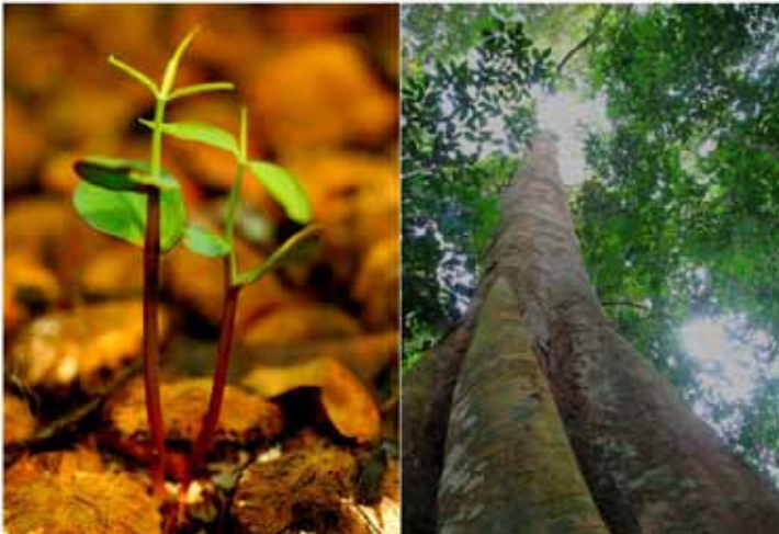
Figure 3. Seedling and adult tree of Irvingia gabonensis .