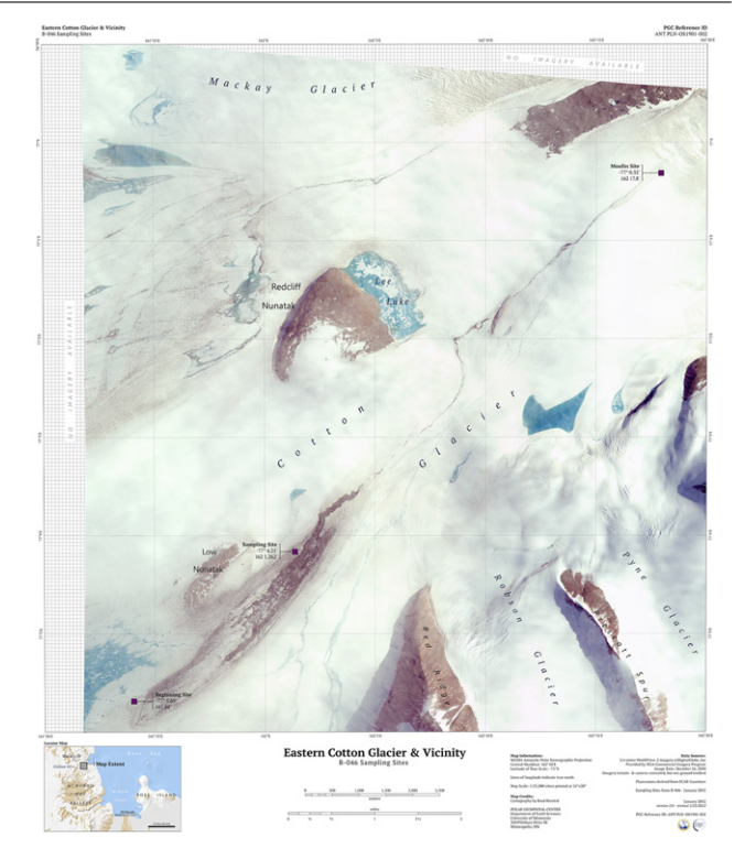
Figure 1. Map showing the location of the Cotton Glacier, Antarctica and the sampling site, the beginning of the supraglacial feature and the terminal moulins at the end of the feature. The image was created by the Polar Geospatial Center using imagery from WorldView-2.

We examined the microbial assemblage and spectral characteristics of the DOM of a remote supraglacial stream system that forms seasonally on the Cotton Glacier in the Transantarctic Mountains. Fluorescence spectroscopy was used to characterize the DOM in the stream. Microbial abundance, activity and community structure were investigated in conjunction with the biogeochemical characterization of the site to understand how the microbial ecology is influenced by DOM quality.