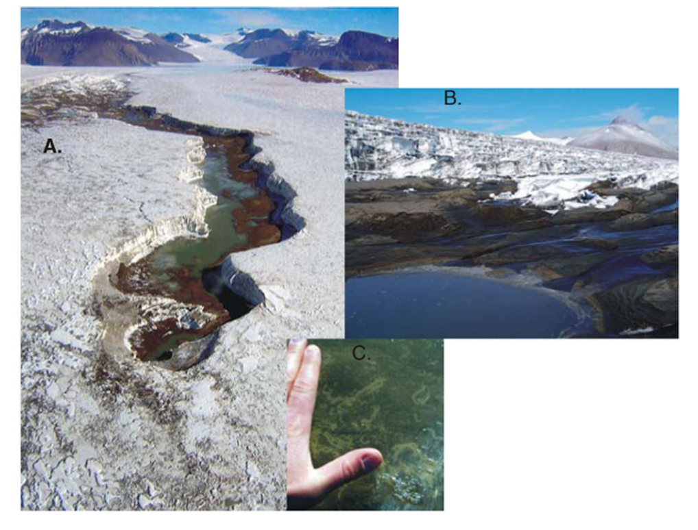
Figure 2. Photographs from the Cotton Glacier, Antarctica. (A) An aerial photograph of the supraglacial stream on the Cotton Glacier. (B) Image of the stream taken from the glacier surface. (C) A Close-up view of the benthos with a hand present to indicate scale.

than for other glaciers in Victoria Land. During the austral summers of 2004–2005 and 2009–2010, we sampled along a braided stream that flowed from mid glacier into a series of crevasses (figure 2). The stream was approximately 16 km long and varied from areas where the stream bed was entirely composed of ice to areas where sandy sediments were present. Stream depth ranged from tens of centimeters to several meters, with areas of still water and high flow.