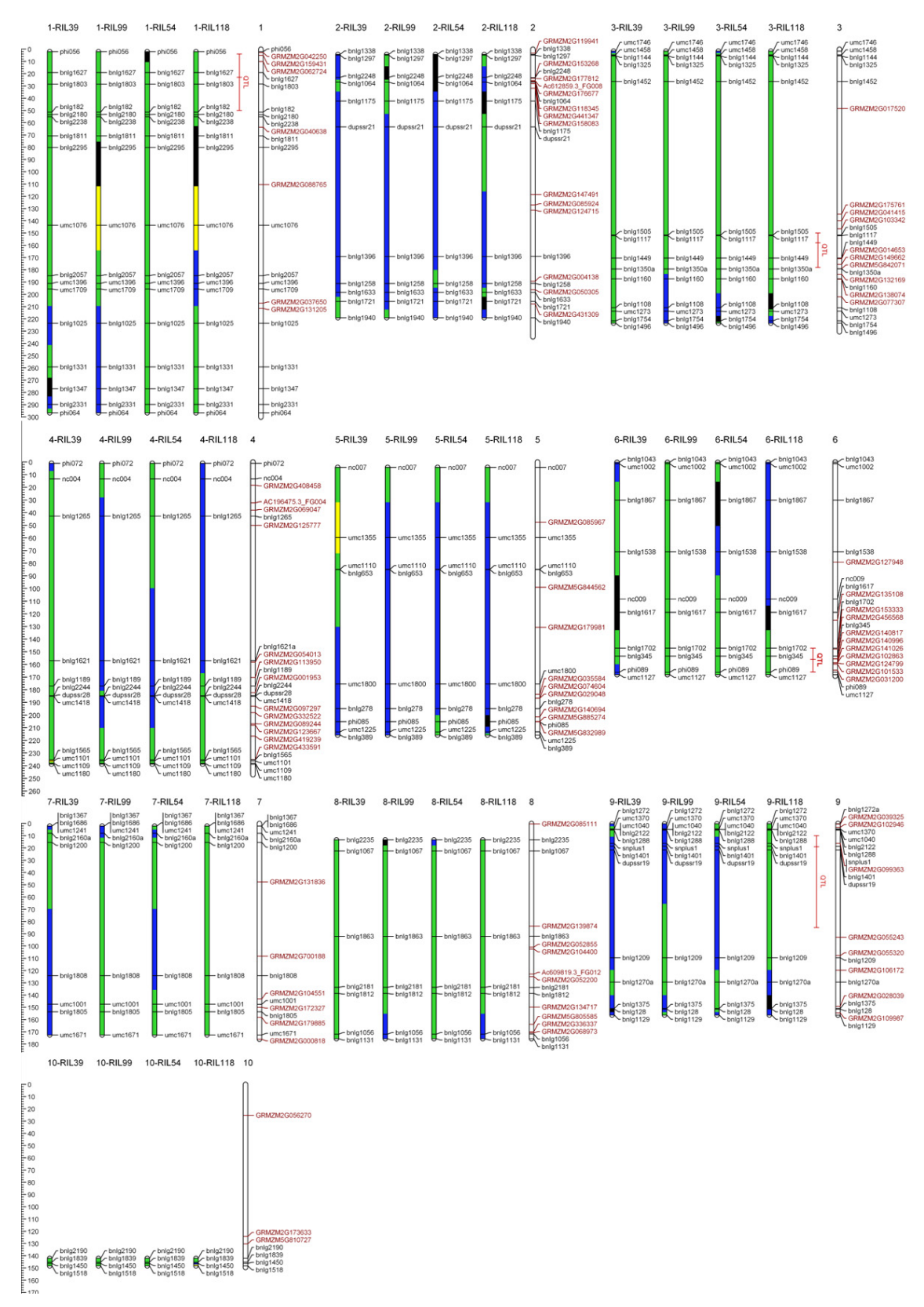
Figure 1 - Physical map of the genome of the four RILs (colour bars) and of the QTLs for cell wall related trait in the RIL F288 x F271 progeny. Candidate genes are positioned on the right bars (white bars). In green= F288 allele, blue= F271 allele, black= unknown allele and yellow= heterozygote.