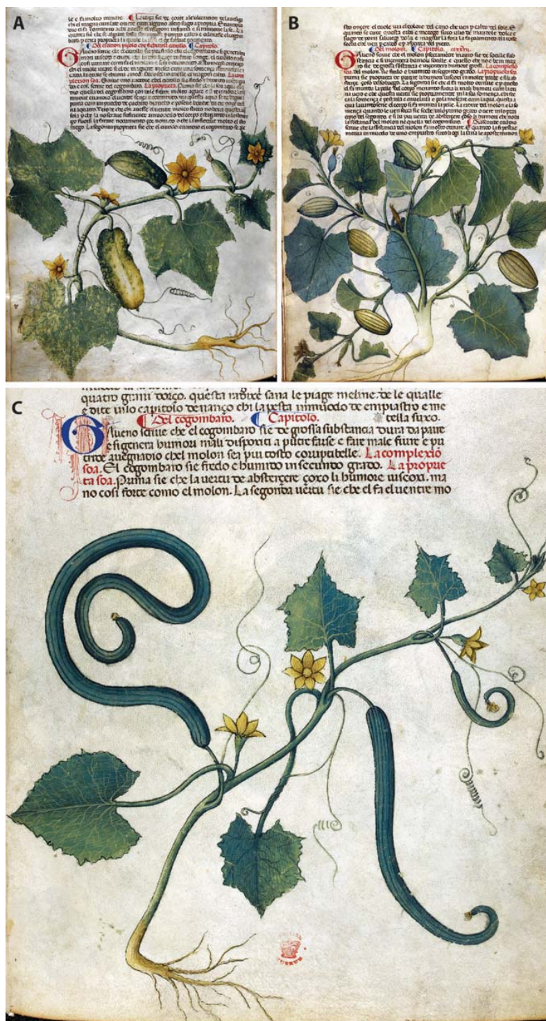
Fig. 3 (A) Carrara Herbal, British Library ms. Egerton 2020, folio 162v. The plant, labelled citron piccolo , citrollò , is cucumber, Cucumis sativus .

(B) Carrara Herbal, British Library ms. Egerton 2020, folio 161v. The plant, labelled molom , is chate melon, Cucumis melo Chate Group.