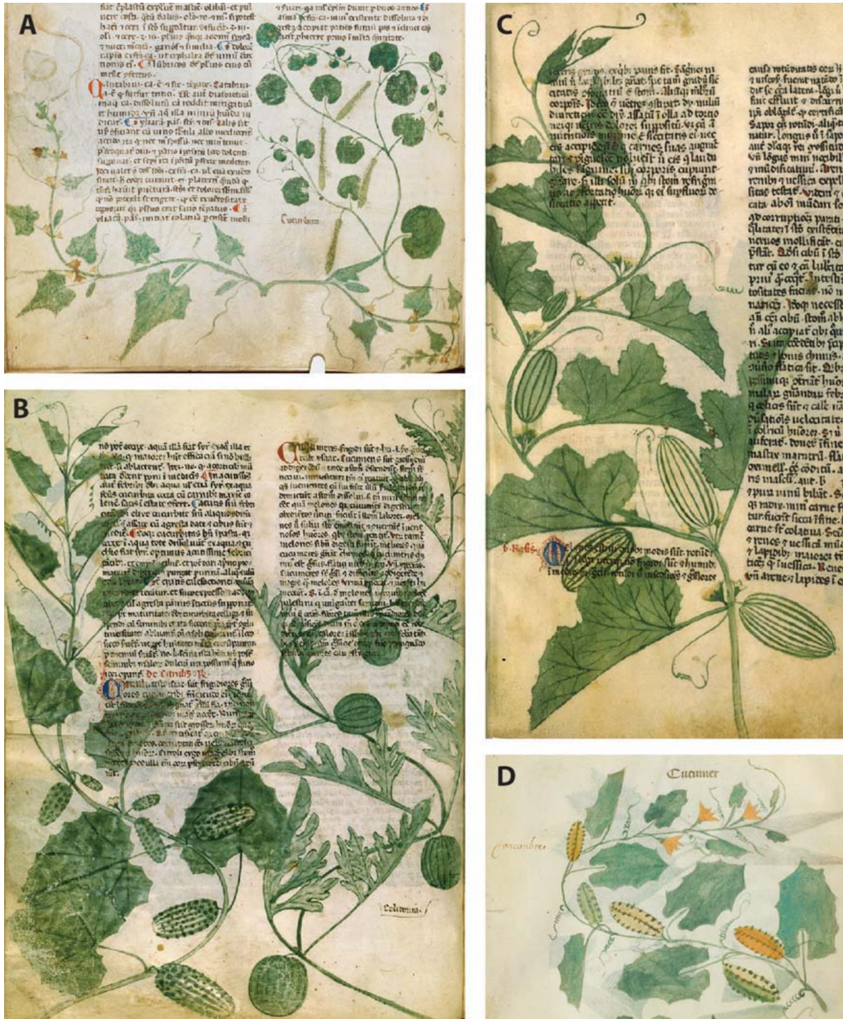
Fig. 1. (A) Tractatus de Herbis , British Library ms. Egerton 747, folio 26v. The plant at the lower left is cucumber, Cucumis sativus . The plant at the right, labelled Cucurbita , is bottle gourd, Lagenaria siceraria .

(B) De Herbis, de Avibus et Piscibus , Manfred Manuscript of Pisa, Italy. BNF ms. Latin 6823, folio 42v. The plant at the left, labelled citruli , is cucumber, Cucumis sativus . The plant at the right, labelled Cucumeris , is watermelon, Citrullus lanatus .