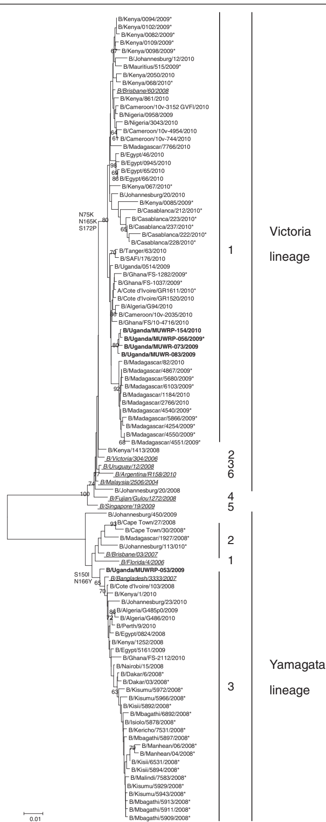
Figure 1 (See legend on next page.)