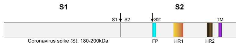
Figure 2. Severe acute respiratory syndrome (SARS)-CoV spike protein schematic. The spike protein ectodomain consists of the S1 and S2 domains. The S1 domain contains the receptor binding domain and is responsible for recognition and binding to the host cell receptor. The S2 domain, responsible for fusion, contains the putative fusion peptide (blue) and the heptad repeat HR1 (orange) and HR2 (brown). The transmembrane domain is represented in purple. Cleavage sites are indicated with arrows.

The important role of the spike protein in cell tropism has been demonstrated with chimeric viruses. There are many strains of mouse hepatitis virus (MHV), viruses that infect mainly the brain and liver. Because of the different patterns of disease associated with the various strains of MHV, involvement of their spike protein in tissue tropism has been extensively studied. The strain JHM is highly virulent causing severe encephalitis that is often lethal, but is poorly hepatotropic. The strain MHV-A59 causes hepatitis and mild encephalitis. MHV-2 is highly hepatotropic. By using chimeric viruses between these different strains, it has been shown that the S protein is linked to the tropism and pathogenesis of MHV. Introduction of JHM or MHV-2 S genes in the MHV-A59 background increases the recombinant virus' neurovirulence and hepatotropism respectively [11,12]. However, replacement of JHM S protein sequence with MHV-A59 S gene in the JHM background does not confer hepatotropism suggesting that other factors modulate virus tropism. A mutant MHV-A59 strain exhibiting altered tropism was isolated from persistently infected microglial cells [13]. The single