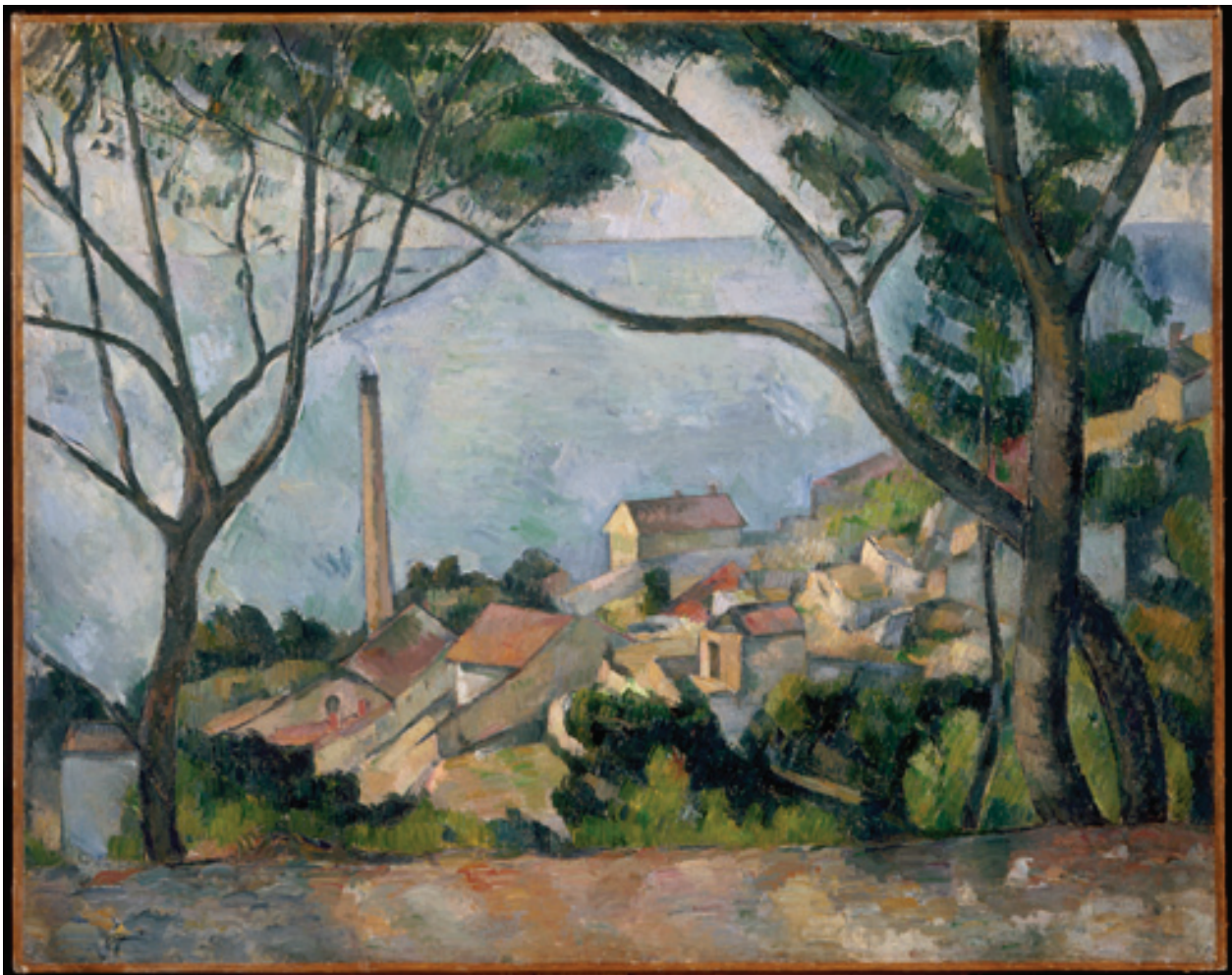
Figure 1. Beyond qualitative imaging. In Paul Cézanne's 'La mer à l'Estaque', trees can easily be recognized in the foreground. Nevertheless, a closer look reveals that the dimensions and geometry of the branches are not realistic at all, illustrating the relative weakness of the human eye and how a qualitative observation can lead to misleading conclusions. Reproduced with permission from Réunion des Musées Nationaux, Paris, France.