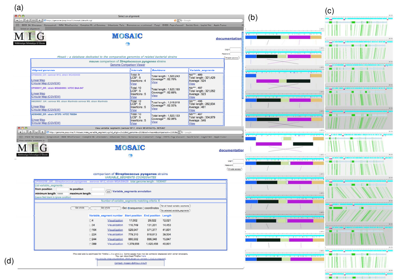
Figure 2 Example of access to a genome comparison through the MOSAIC Web interface. Twelve Streptococcus pyogenes strains are compared. (a) Main MOSAIC Table describing the general properties of the comparison. A click on the "genome comparison viewer" link gives access to the graphical overview of the five LCBs shown in (b). Selection by clicking on any LCB of the first genome allows the user to zoom in to visualize the backbone/variable segment organization resulting from the alignments, as shown in (c). Backbone regions are shown as grey bars, and variable segments as green bars; genome annotations are superimposed (genes in blue, tRNAs in red). From the main Table (a), access to browse Backbones, Intervals, or Variable Segments [as shown in (d)], is provided.

an additional column lists the number of "Intervals" detected by the alignment procedure. Intervals include LCBs and "Insertions". The table also gives access to graphical visualization of the aligned genomes. Figure 2b shows an example of the graphical global representation of all aligned genomes using the Genome Comparison Viewer. Once the global view of all aligned chromosomes is generated with the viewer, it is possible to click on each LCB of the first chromosome and then to browse collinear regions of all compared chromosomes. This allows visualization of the backbone and variable segments, together with genome annotations as shown in Figure 2c. Lastly, the table includes links to the detailed list of backbones, variable segments, and, when available, intervals, via the item "View". By following the links it is possible to download these elements in various formats (Figure 2d). Case study Using MOSAIC to compare 12 S. pyogenes chromosomes, one can observe that the chromosomes are mostly collinear, with the notable exception of large inversions in strains Manfredo and SSI-1 (Figure 2b). This comparison allowed us to define a backbone 1,500 kb long corresponding to approximately 80% of the total length of the