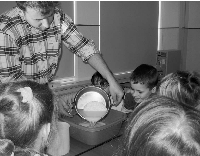
FIGURE 3 On-farm educational activities in Val di Sole, Italy: A farmer shows schoolchildren how cheese is made.

not only at the early stages when the group is defining objectives, but also later in the action implementation phase. There are a number of reasons for this. In the action implementation phase, concrete decision making modifies the problem, requiring new knowledge in that issues are taken into account that were initially ignored. Reformulation may also be related to changes within the local group and its network. Stakeholders from outside often initiate reformulation as they bring in new perspectives, new kinds of knowledge and networks. In Murau, for instance, the cooperative for wood energy changed its objective from selling wood chips to being a major actor of “Energy Vision 2015.” This project launched in the district of Murau in 2001 aims at achieving energy self-sufficiency for the whole district by the year 2015. Reformulation of the problem has gone hand in hand with a scaling-up of the group and a broadening of the partnerships forged at regional level.