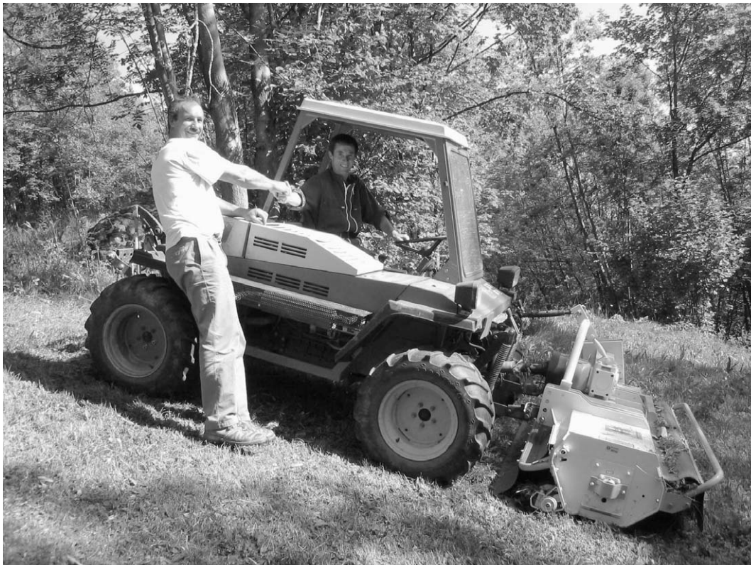
FIGURE 2 A services cooperative of farmers in Moyenne-Tarentaise, France.

identity of actors, the possibilities of interaction, and the margins of maneuver are negotiated and delimited (Callon 1986).