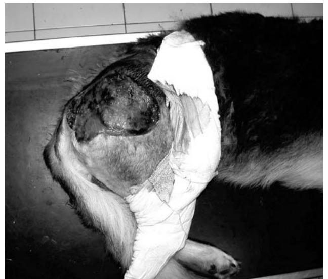
Figure 1. Unique cutaneous lesion on the right side of the hip in an 8 month-old German Shepherd. The lesion had appeared 4 months before this image was taken and had rapidly evolved into a large ulcer with draining tracts.

To obtain a specific identification, genomic DNA was extracted from biopsy specimens collected from the infected tissues (Dneasy Tissue kit, Qiagen, Valencia, CA, USA) and was further subjected to internal transcribed spacer (ITS) and 5.8S rRNA gene sequencing by using primers ITS1 and ITS4 (5). Sequencing reaction was performed in a 10- \mu\text{L} volume containing 50 ng of sample DNA, 4 pmol of primers, and 4 \mu\text{L} of BigDye Mix (Applied Biosystems, Foster City, CA, USA). The unique polymerase chain