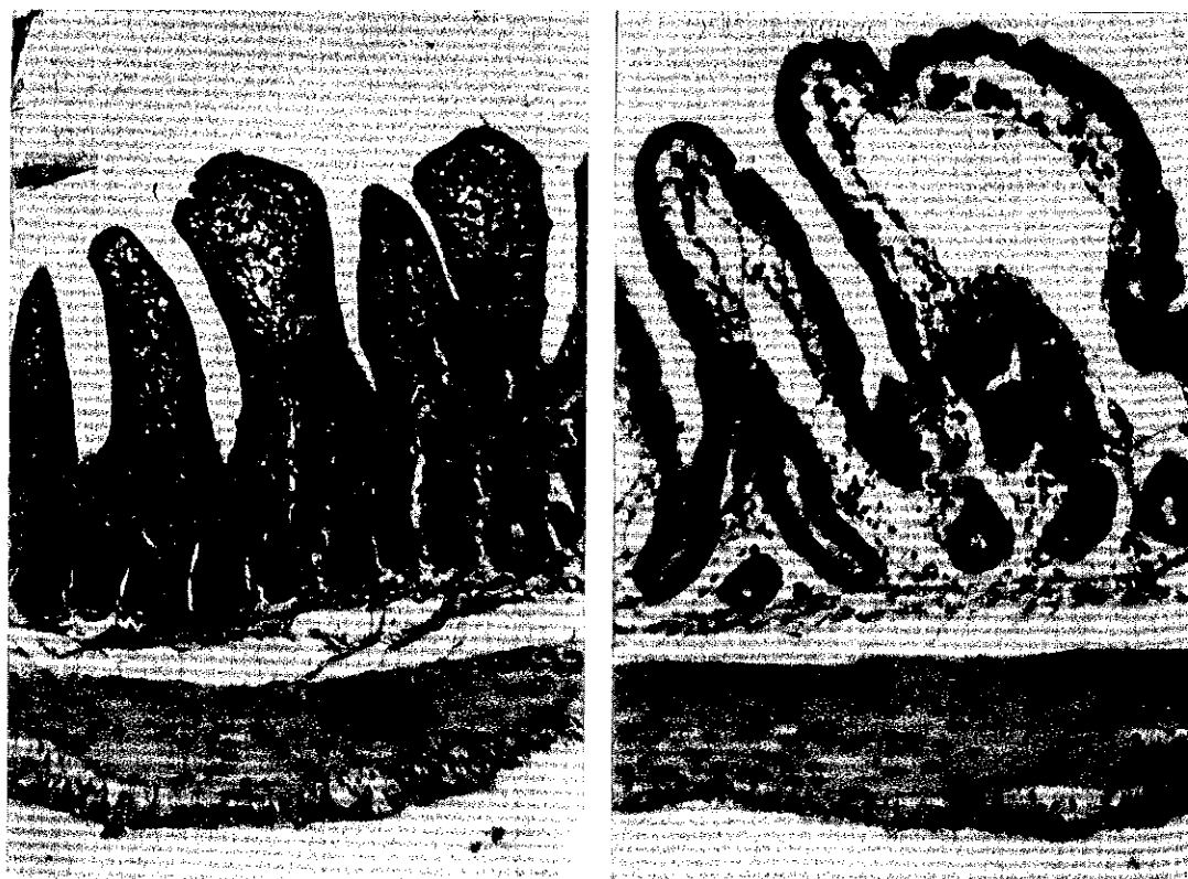
Figure 1 Transverse section of guinea pig ileum from: (a) 'Control group', i.e. animals given 0.9% NaCl saline intraperitoneally: normal aspect of the full thickness of the ileal wall; (b) 'TNBS group', i.e. animals killed 6 days after being given TNBS intrajejunally: note the dramatic enlargement of the lymphatic central capillary of the villi, and that the interglandular spaces of the lamina propria are oedematous. (Original magnification \times 95 ).

doxantrazole, indomethacin, MK-886 or L-NAME. In contrast, critical inflammation was observed in intestinal tissue samples taken from animals which received TNBS into the jejunum and saline systemically ('TNBS group'). It was characterized by severe transmural inflammation, extended randomly from the injection site in the jejunum, down to the distal ileum. Macroscopically, there were areas of grossly visible bowel wall thickening, associated with major sites of inflammation and/or mucosal ulceration. Microscopically, an enlargement of the central lymphatic capillary in the core of the villi, and an oedema of the lamina propria were observed (Fig. 1b). In some areas, ulcerative foci extended through the mucosa, and the lamina propria was infiltrated by mononucleated cells (mast cells and macrophages), and scattered eosinophils and neutrophils. In the 'TNBS-INDO' group (Fig. 2a), the histological profile was similar, thus highlighting the absence of beneficial effects after blockade of prostaglandin synthesis. In contrast, in the 'TNBS-MK' group (Fig. 2b), as well as in the 'TNBS-DOX' and 'TNBS-NAME' groups, healing patterns were observed. These latter were characterized macroscopically by the almost normal appearance of the major part