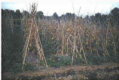
Fig. 6. Many soilborne diseases that were formerly of little consequence in China are becoming increasingly important. Nearly all of the cucumber plants in this field, photographed in summer 1986, were destroyed by Fusarium oxysporum before the fruit could be harvested.

Diminishing labor resources is also prompting farmers to use mechanization