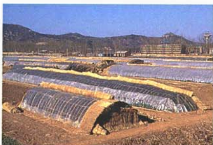
Fig. 3. Plastic shelters to extend the growing season for vegetables in northern China are used so intensively that they have become sources of disease inoculum. Loss of agricultural lands to urban expansion increases the need for such intensive crop production.

Before the 1980s, the nationally administered research funds for agriculture were distributed on a non-competitive basis. Consequently, many research efforts were duplicated. But in the surge toward modernization in the 1980s, the research community expanded rapidly and greatly taxed the Ministry of Agriculture's budget. In 1986, the National Natural Science Foundation (NNSF)—with a budget of several hundred million yuan (1)—began to include applications from researchers outside of the CAS for consideration in the awarding of competitive grants. In early 1987, the Ministry of Agriculture announced that funding priority would be given to applied studies and that workers in basic areas could turn to the NNSF. We recall the intense efforts of research groups at the time of this proclamation to rethink the direction of their projects and establish at least one project with direct short-term application. Hence, there are now plans for commercial and recreational ice production catalyzed by ice-nucleation-active bacteria and large-scale production and marketing of