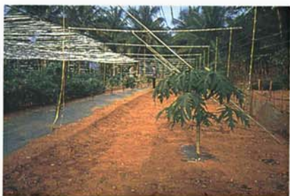
Fig. 8. Reflective tape is used to repel the insect vectors of papaya virus in experimental papaya production at the South China College of Tropical Crops, Hainan Island.

Undergraduate programs. Access to undergraduate programs in plant pathology is gained by successful performance in a written, highly competitive national examination usually taken just after graduating from high school. The examination is common for all scientific programs in all colleges and universities of China and includes seven subjects (Chinese, English, mathematics, physics, chemistry, biology, and politics). The assignment of each student to a particular university department is based on the compatibility of the student's score with the minimal eligibility score required for the desired study program. The procedure is further complicated by a score compensation system based on the province of origin of the student and aimed at fostering a higher level of education among the residents of certain self-labeled "less developed" provinces.