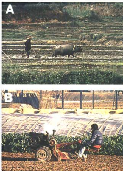
Fig. 7. (A) Although horse- and ox-drawn plows are still widely used by Chinese farmers, (B) the use of tractors is on the rise and is affecting cropping patterns.

Resources. Field plots. Disbanding of the people's communes has made it difficult to conduct field experiments at units with no associated or convenient experimental farms. BAU is one such example. During the era of the communes, sufficient land and labor were available from the neighboring commune, and at least one production brigade was responsible for experimental studies. They readily cooperated with researchers in doing field experiments (9). But at present, in villages that have not continued some collective farming, individual households each maintain only about 0.2–0.5 ha, and there has been a drastic loss in farmer cooperation. Researchers might rent land from farmers and pay for labor at a cost of up to Y4,500/ha per season. An alternative to renting land is to establish a collaborative project with county-level plant protection stations. These stations generally have established trusting relationships with local farmers and can facilitate cooperation. Many agricultural colleges, universities, and research institutes have convenient access to experimental farms (Fig. 8) ranging in size from about 50 to 1,000 ha, depending on proximity to urban centers. Use of the land may be free or cost about Y1,500/ha.