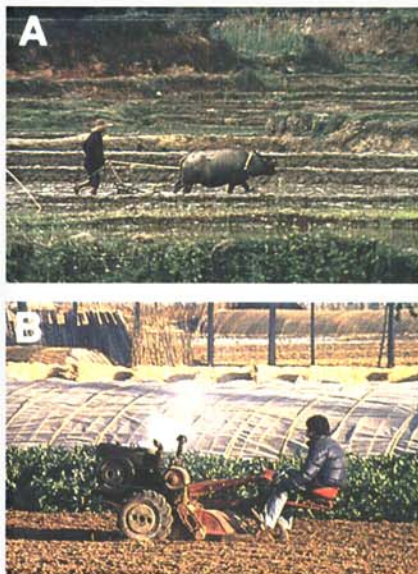
Fig. 7. (A) Although horse- and ox-drawn plows are still widely used by Chinese farmers, (B) the use of tractors is on the rise and is affecting cropping patterns.

Resources. Field plots. Disbanding of the people's communes has made it difficult to conduct field experiments at units with no associated or convenient experimental farms. BAU is one such example. During the era of the communes, sufficient land and labor were available from the neighboring commune, and at least one production brigade was responsible for experimental studies. They readily cooperated with researchers in doing field experiments (9). But at present, in villages that have not continued some collective farming, individual households each maintain only about 0.2–0.5 ha, and there has been a drastic loss in farmer cooperation. Researchers might rent land from farmers and pay for labor at a cost of up to Y4,500/ha per season. An alternative to renting land is to establish a collaborative project with county-level plant protection stations. These stations generally have established trusting relationships with local farmers and can facilitate cooperation. Many agricultural colleges, universities, and research institutes have convenient access to experimental farms (Fig. 8) ranging in size from about 50 to 1,000 ha, depending on proximity to urban centers. Use of the land may be free or cost about Y1,500/ha.