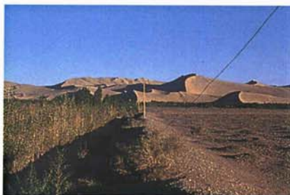
Fig. 4. This agricultural field in Gansu Province is one of many being reclaimed from China's northwestern deserts. Poplars are frequently used in desert reclamation and may suffer from multiple diseases in this stressful environment.