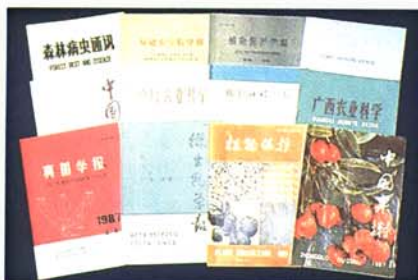
Fig. 9. Some of China's many journals that publish articles related to plant pathology research.