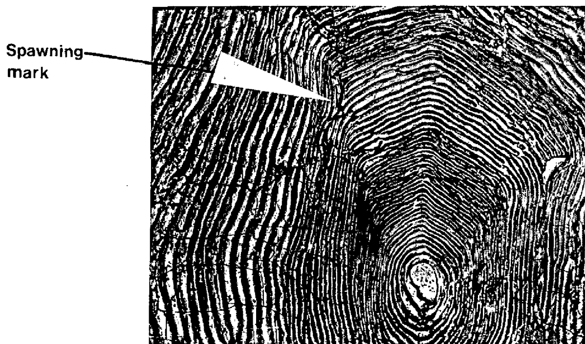
Fig. 1. Atlantic salmon scale, showing spawning mark at age 2 (maturity at parr stage).

at the end of their first winter were calculated. In adults, smolt length was back-calculated from length proportionality of fish-length/scale-length at the smolt stage. To estimate parr size of these fish in their first and second winters, the body—scale relationship calculated from the corresponding parr cohorts was used. The autumn and first winter growth of parr was estimated from the number of appropriate days for growth, i.e. those during which the average temperature was \geq 7^{\circ}\text{C} (Allen, 1941; Egglshaw and Shackley, 1977; Brett, 1979; Symons, 1979). Instantaneous growth rate was calculated using: G = 100 (\log L_2 - \log L_1) / \Delta T , where \Delta T represents the number of appropriate days. Based on our observations and those of Pedley and Jones (1978), G was calculated to be 0.1. By using such back-calculated values, and values for winter growth, we have been able to determine the length of 1+ parr in their first autumn.