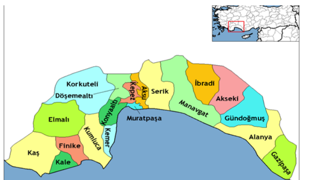
Figure 1. Turkish districts