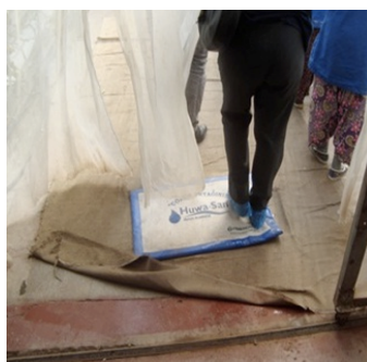
Footbath at the entry of greenhouse