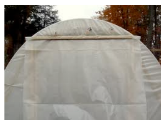
Curtain for doors