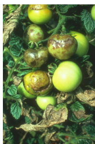
Elimination of first contaminated plants