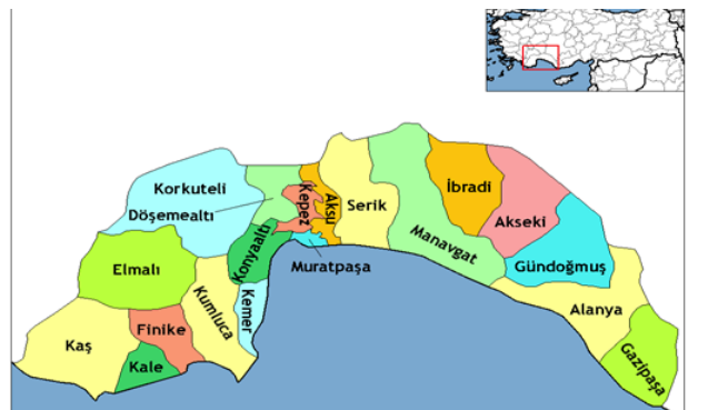
Figure 1. Turkish districts