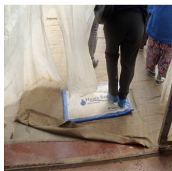
Footbath at the entry of greenhouse