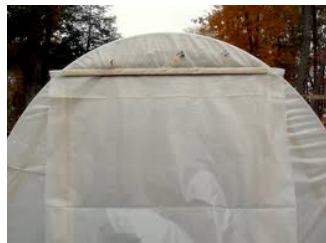
Curtain for doors