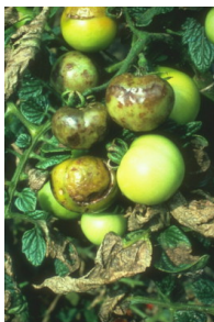
Elimination of first contaminated plants