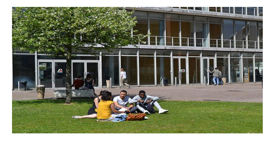
UFR Santé, University of Rouen, France