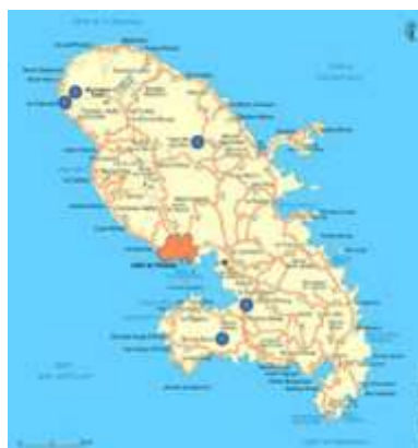
Figure 2– Geographical location of animals collected

Until now, blood samples of a total of 26 pigs (around one third of the targeted number of samples) from 5 farms (Figure 2) were collected. These animals showed phenotypes which are commonly observed in well-known Creole pigs. Most of them are living outdoors. Serological analysis showed that all animals were negative by both classical swine fever; brucellosis; Aujeszky's disease; porcine reproductive and respiratory syndrome virus. To our very knowledge, the local pig of Martinique is not yet genetically characterized at the opposite of other Carribean regions such as in Cuba (Velázquez et al. 1998), Mexico (Sarabia et al. 2011) or Guadeloupe (Canope and Raynaud 1981). Nevertheless, based on the historical background of the Caribbean area and South America and the well characterized local pig populations in these countries (Burgos-Paz et al. 2013), there are very few doubts that the local pig of Martinique is from Creole types. Moreover, phenotypes of local pigs observed in different farms of the Martinique's territory, argue for this Creole appurtenance.