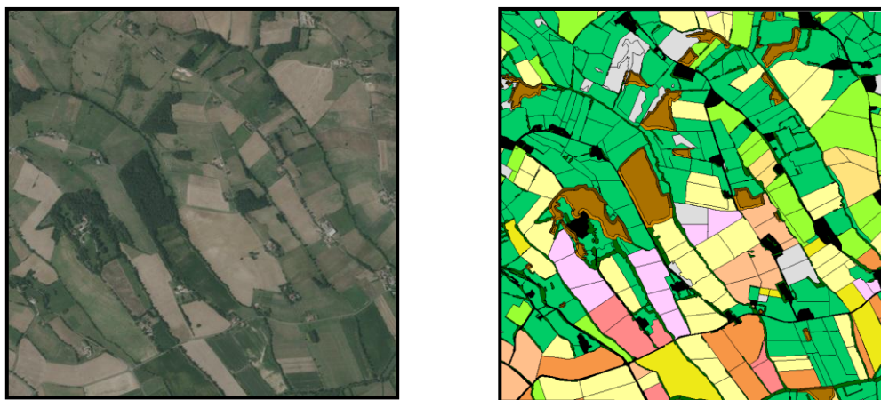
Figure 1: Satellite image (2010) and simulated landscape (based on the 2012 land-cover) (see Table 1 for color codes). The simulated landscape is 2km x 2km. The satellite image is an IGN orthophotograph (BDortho®) with a spatial resolution of 0.5m.

Figure 1 shows the landscape representation provided by the model beside a satellite image of the real landscape. . We are currently gathering data on the distribution of crop covers in the LTER landscape each year in order to compare and validate our simulated landscape with the real one.