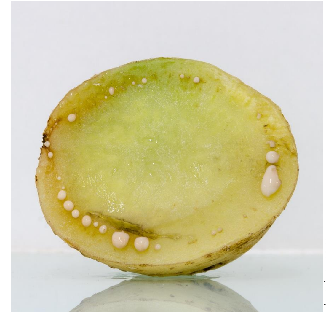
Photo 2. Brown vascular vessels with bacterial ooze on potato tuber

(1) CIRAD, UMR PVBMT, Saint-Pierre, La Réunion, France; (2) Anses, Plant Health Laboratory (LSV), Saint-Pierre, La Réunion, France; (3) INRA, Département Santé des Plantes et Environnement, Paris, France; (4) Université de la Réunion, UMR PVBMT, Saint-Denis, La Réunion, France; (5) Établissement Public National de Coconi, Coconi, Mayotte, France; (6) SAA (Seychelles Agricultural Agency), Seychelles; (7) INRAPE (Institut National de Recherche pour l'Agriculture, la Pêche et l'Environnement), Comoros; (8) FAREI (Food and Agricultural Research and Extension Unit), Mauritius, (9) University of Mauritius, Mauritius, (10) ARMEFLHOR, Saint-Pierre, La Réunion, France.