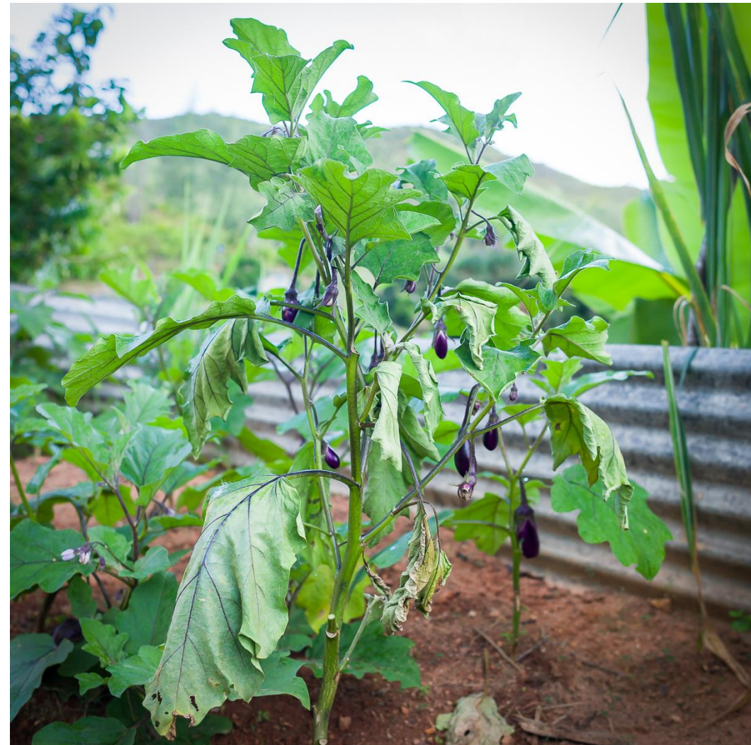
Photo 1. Leaf epinasty of eggplant